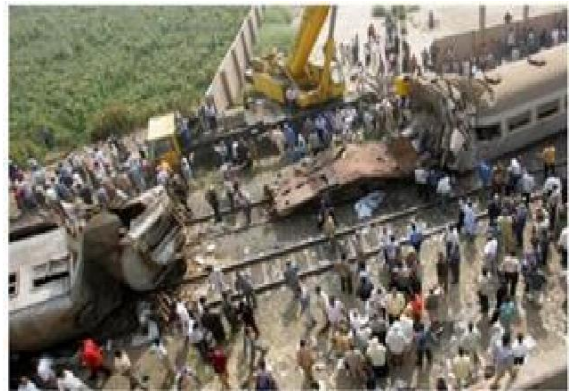
Fig- (b) Rear-end- Collision