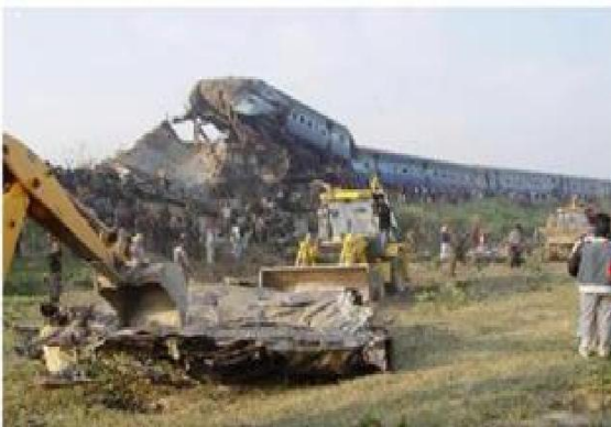
Fig-(a) Head- on- Collision

A head-on collision is one where the front ends of two ships, trains, planes or vehicles hit each other, as opposed to an aside-collision or rear-end collision.. With rail, a head-on collision often implies a collision on a single line railway.