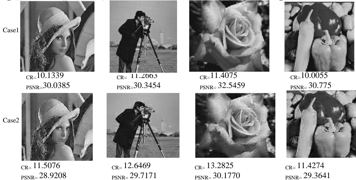
Fig. (3): Decoded image using the hierarchal polynomial coding, using quantization coefficients equals to 1 for both layers, quantization step of error layer1 error is equal to 50, with (Case1) quantization step of error layer2 is equal to 2 and (Case2) quantization step of error layer2 is equal to 20