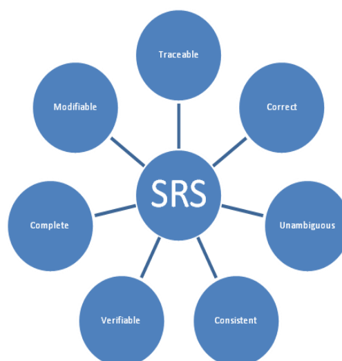
Fig. 1 Features of SRS

Software Requirement Specification is a document which requires all functionality for a system to be developed. It covers some of the aspects such as performance, design, quality, and many more. Due to globalization of market and effects of economy, we require Distributed Software Requirement Systems which is helpful for stakeholders. Different stakeholders will need different data from different storages. SRS should be correct, unambiguous, complete, consistent, verifiable, modifiable, traceable.