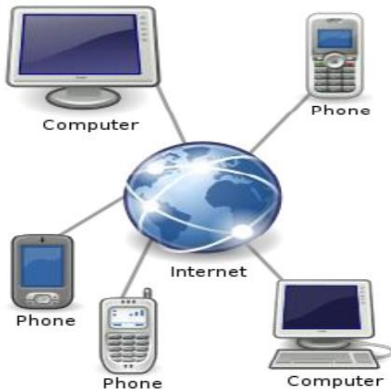
Fig 3. Voice over Internet Protocol (VoIP)

4) Telecommuting, e-driving, e-work, working from home, working at home (WAH), or working from home (WFH) is a work arrangement in which delegates acknowledge versatility in working zone and hours. An once in a while repeated adage is that "work is something you do, not something you go to". Long partition working from home is supported by such instruments as virtual private frameworks, videoconferencing, and Voice over IP. It can be capable and supportive for associations as it grants staff and experts to pass on over a broad detachment, saving immense measures of travel time and cost. As broadband Internet affiliations end up being more common, more workers have enough information transmission at home to use these instruments to associate their home office to their corp.