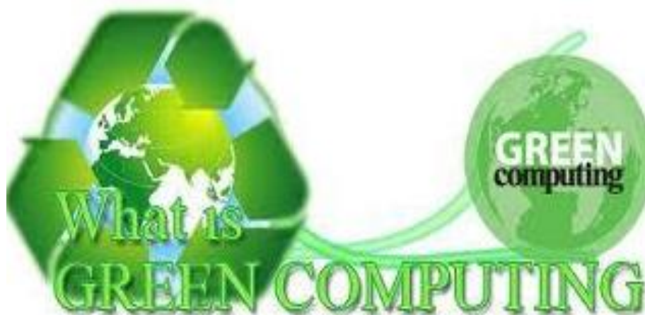
Fig 1. What is green Computing?

Green computing, the study and routine of effective and eco-accommodating processing assets, is currently under the consideration of ecological associations, as well as organizations from different businesses. Lately, organizations in the PC business have come to understand that practicing environmental safety is to their greatest advantage, both as far as advertising and decreased expenses. In 1992, the U.S. Natural Protection Agency dispatched Energy Star, a deliberate naming program that is intended to advance and perceive vitality productivity in screens, atmosphere control hardware, and different advances. This brought about the boundless reception of rest mode among purchaser hardware. Green Computing is additionally characterized as the investigation of planning, assembling/building, utilizing and discarding registering gadgets in a way that diminishes their natural effect. Numerous IT producers and sellers are ceaselessly putting resources into planning vitality proficient figuring gadgets, decreasing the utilization of hazardous materials and empowering the recyclability of computerized gadgets and paper. Green computing practices appeared in 1992, when the Environmental Protection Agency (EPA) dispatched the Energy Star project.