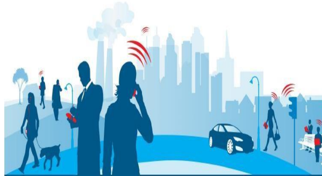
Fig: Wireless Communication System

world of universal, uninterrupted access to information, entertainment and communication will open new dimension to our lives and change our life style significantly.