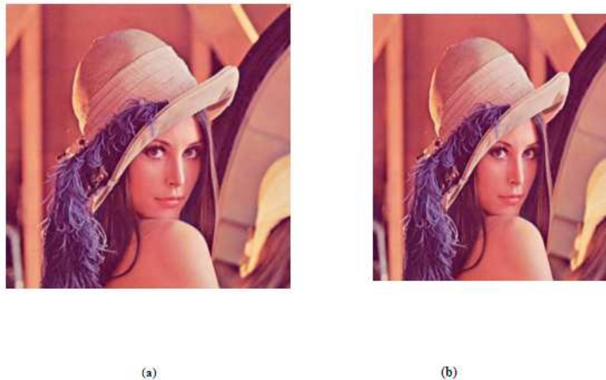
Fig. 3: Experimental result of the proposed method on colored images.

Usually the invisibility of the hidden message is measured in terms of the Peak Signal-to-Noise Ratio ( PSNR ) defined in equation (8), where p(x,y) represents the color shade level of a pixel, whose coordinates are (x,y) in the original image, and p^{(x,y)} represents the same pixel in the distorted image. Equation (10) presents the Root Mean Square Error ( RMSE ) as a measurement criterion.