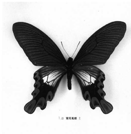
(b) Maraho image (512x512)