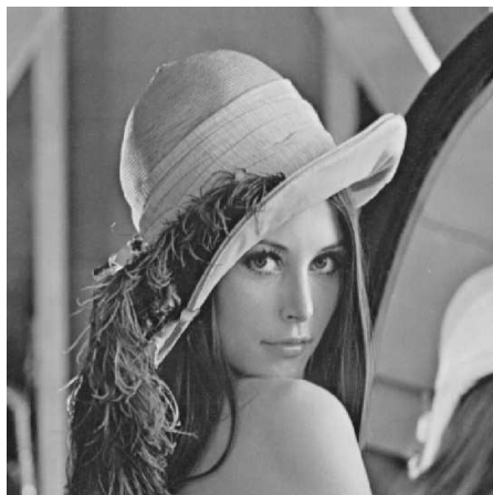
(a) Lena image (512x512)