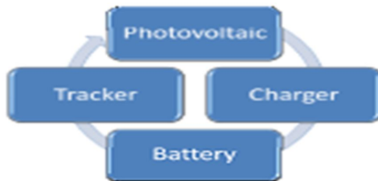
Fig.2 Relations between main parts of the system

The smart solar system is a self-powered system; all components of the system depend on each other's, the system does not need any supply from the external world but only sun light. Those components interconnect with each other's in order to form a closed system. The solar radiation gathered by the photovoltaic cell is transformed into electrical energy; the panel will feed the input of the charger which will charge a 12 Volt DC battery. The second functionality of the cell is to give precise voltage to the tracker, in order to reach the most efficient direction and orientation of the system which will allows maximum sunlight absorption. The battery will supply the system with a 12 Volt DC. The motors, the charger, the tracker and the sensors are supplied by the battery. The battery is charged by the photovoltaic cell through the charger controller as shown in figure