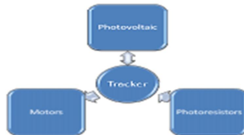
Fig.3 Dependency of the tracker

processor, this will guide the system in a x-y-z plane, that means all angles and locations can be detected and reached due to the two motors (two rotational axes). The accuracy of the system is enhanced by the gear factor and ratio, the used steppers motors are of 3.5 degrees/step, with the gears added to the motors many factors were improved such as the degree/step (less degree per step which leads to better accuracy in position and angles) and high torque for the motors.