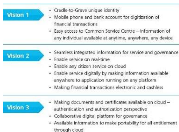
Figure 2: Vision areas enabled by Analytics