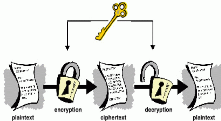
Fig. 2 Symmetric Encryption

The merit of ‘symmetric key cryptography’ is that the key management is very simple as one key is used for encryption as well as for decryption. In case of symmetric key cryptography the key is secret as in [2].