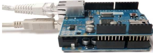
Figure 2 Ethernet shield mounted on Arduino board for power connect to server by using USB cable

The Arduino Ethernet Shield allows to easily connecting Arduino to the internet. This shield enables Arduino to send and receive data from anywhere in the world with an internet connection. It can be used to do fun stuff like control robots remotely from a website, or ring a bell every time you get a new twitter message. This shield opens up endless amounts of possibility by connecting the project to the internet in no-time flat.