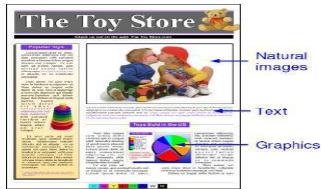
Fig. 1 – Example of a compound image.

At this point Pre-processing methods used, it is a small neighborhood of a pixel in an input image to get a new brightness value in the output image [3]. Such pre-processing operations are also called filtration. If the images are too noisy or blurred, the images should be filtered and sharpened. In image processing, filters are mainly used to suppress either the high frequencies in the image [4]. The various types of linear and non-linear filters are used to reduce the noise. There are two types of compression techniques are used to reduce file size of an image they are lossy and lossless compression. Both lossy and lossless compression various algorithms are used to compress a compound image. After compression, the decompression process has to be made to get the original compound image.