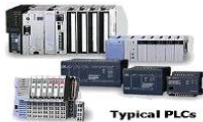
Figure 2.1: Typical of PLC

A Programmable Logic Controller, PLC is a digital computer used for automation. It is an interface between program and the inputs. It is a programmable software.