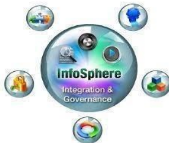
FIG 2.IBM INFOSPHERE

IBM InfoSphere DataStage is an ETL tool. It is part of the IBM InfoSphere and IBM Information Platforms Solutions suite. It is a very useful platform which is used to build various data integration solutions. It has various versions which include the Server Edition, the Enterprise Edition, and the MVS Edition [5].