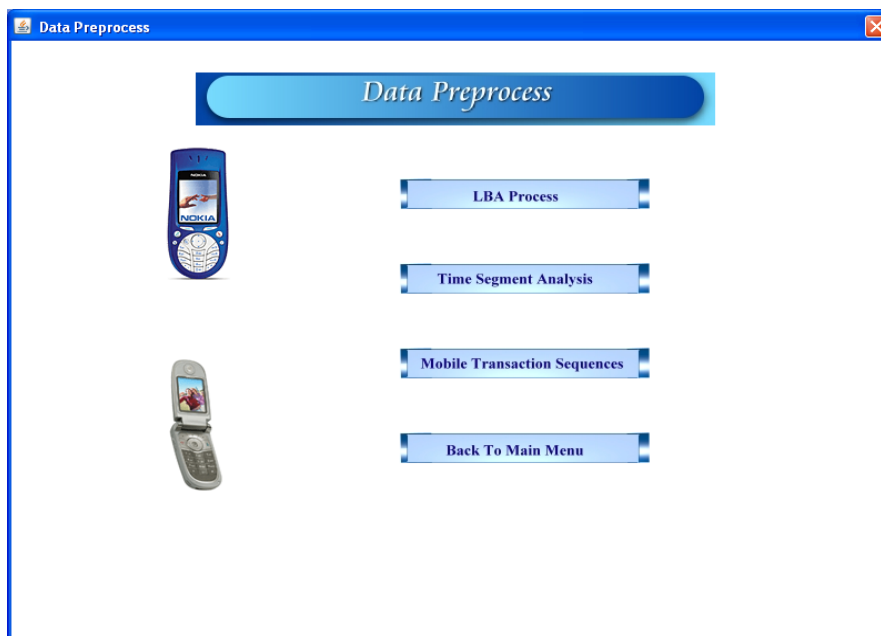
Fig. 2 Data Preprocess

Once the implementation plan is decided, it is essential that the user of the system is made familiar and comfortable with the environment. Education involves right atmosphere & motivating the user. A documentation providing the whole operations of the system is being developed. The system is developed in such a way that the user can work with it in a well consistent way. The system is developed user friendly so that can work the system from the tips given in the application itself. Useful tips and guidance is given inside the application itself to help the user. Users have to be made aware that what can be achieved with the new system and how it increase the performance of the system. The user of the system should be given a general idea of the system before he uses the system.